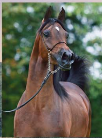
ROL Pacific Mist