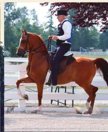
ROL Cycret Service