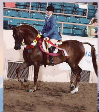
Top: ROL Fire Mist Middle: ROL Fire Lily Bottom: Cycret Agent+