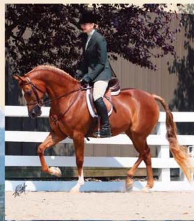
Dancin In Cylk