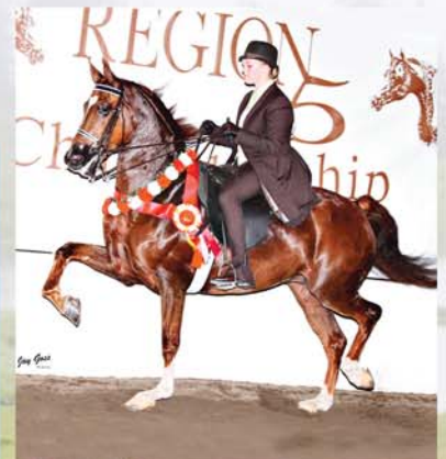
above: JS Martini left: ROL Movin And Groovin