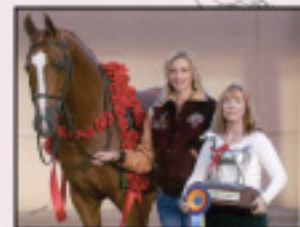
ROL Cymply Hot